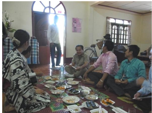
Eating Japanese foods with teachers