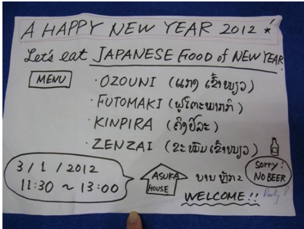
Menu of Japanese foods of a new year