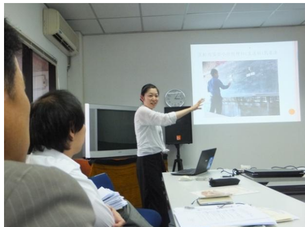
My presentation about activities in Salavan TTC