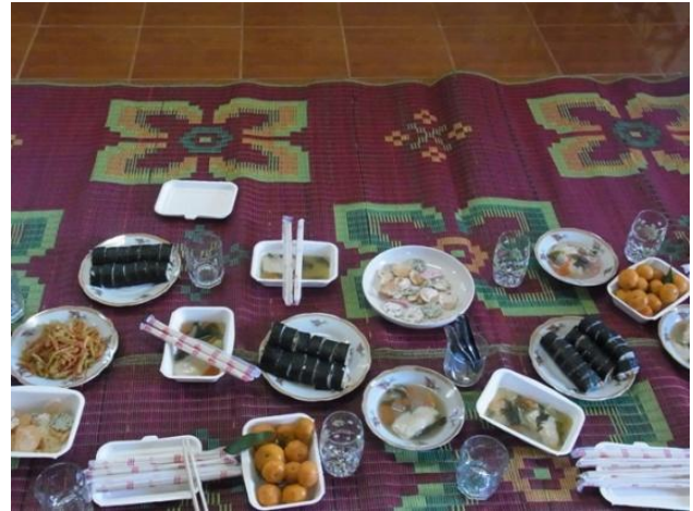
Preparation of Japanese foods