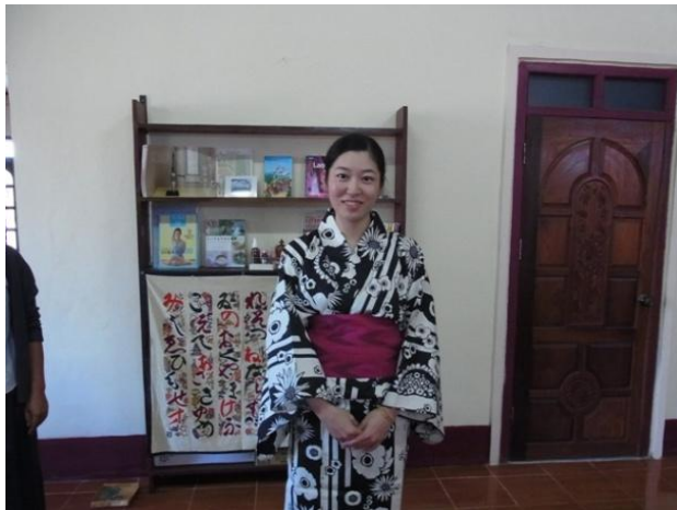
"YUKATA" Japanese traditional clothes