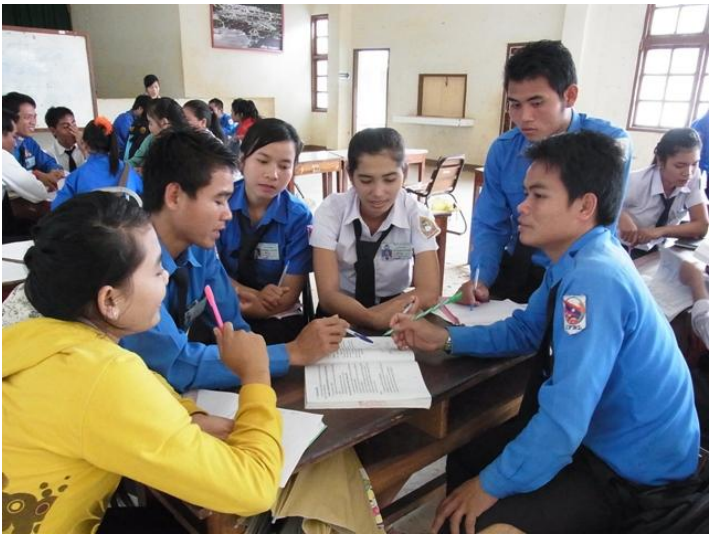
Students select a subject of a practice lesson