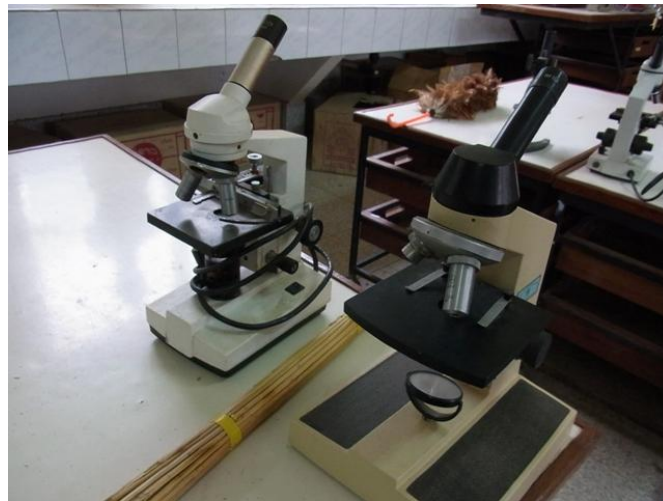
Cleaning and adjust of microscope