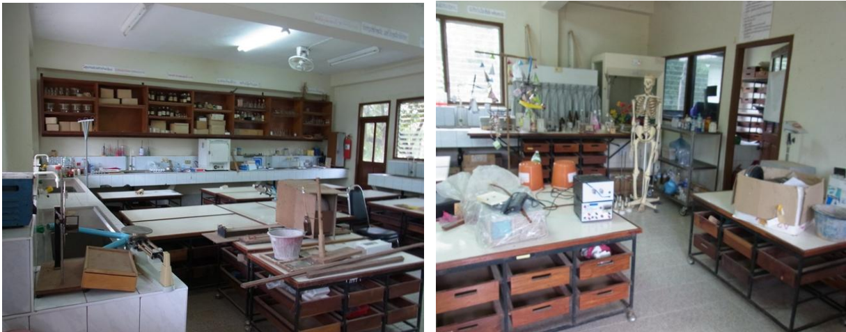
Planning for improvement of laboratory