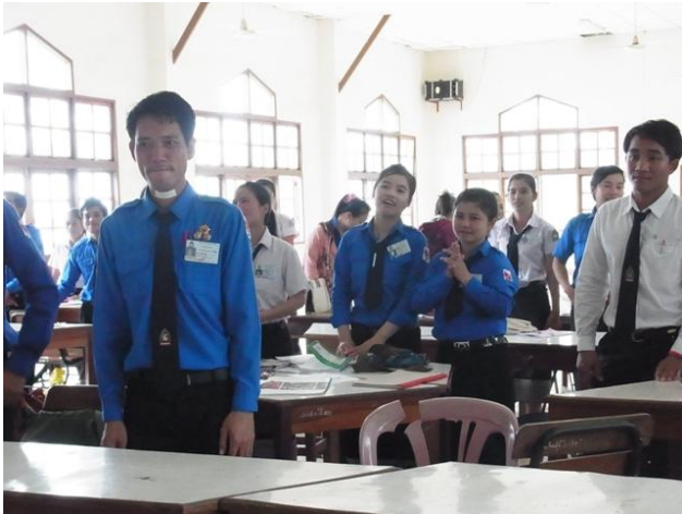
Students join the games