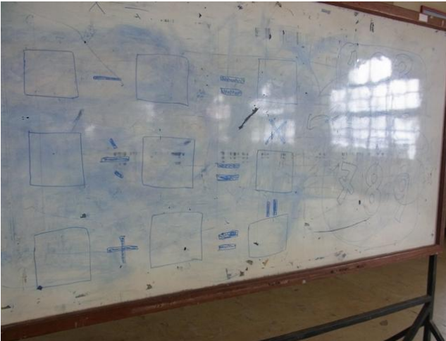
Playing some games of number