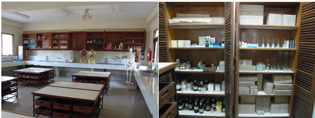
Arrangement of Lab Equipment